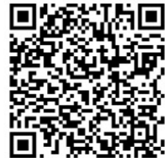
Mentor of the Year