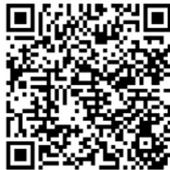
Educator of the Year